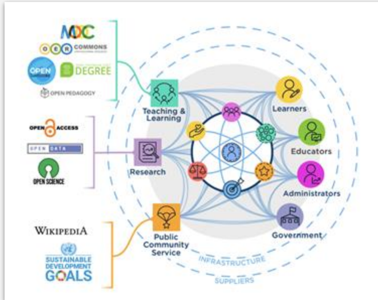
Image from " Open for Public Good " - Open Education Global Strategic Plan 2021-2030 licensed under a Creative Commons Attribution 4.0 International License (CC BY 4.0) .

Open Knowledge Systems within the Education Ecosystem